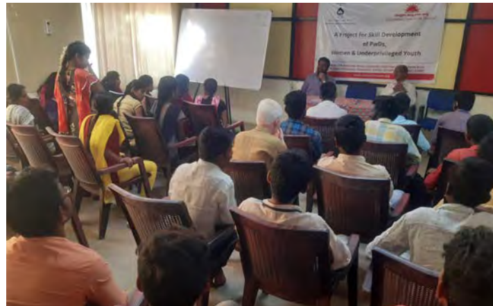
Motivational class, Kodikonda