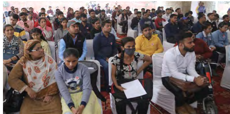
Job Fair at Delhi