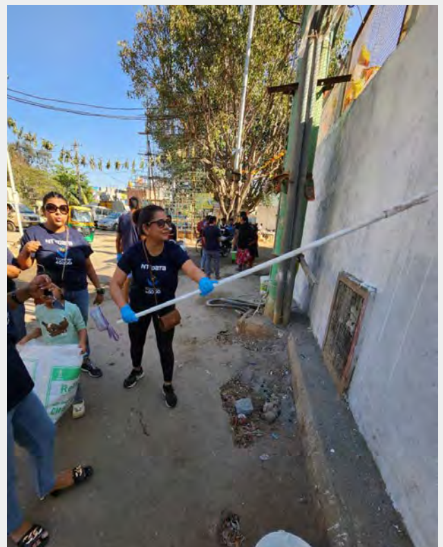
NTT Data volunteers at work