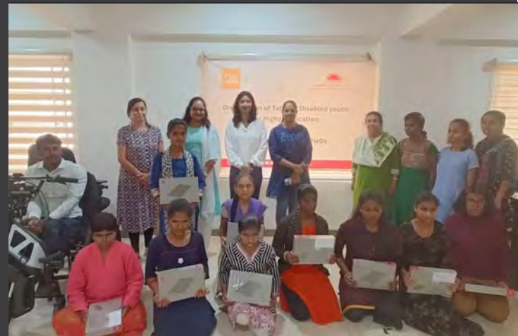
Tab distribution by QS India