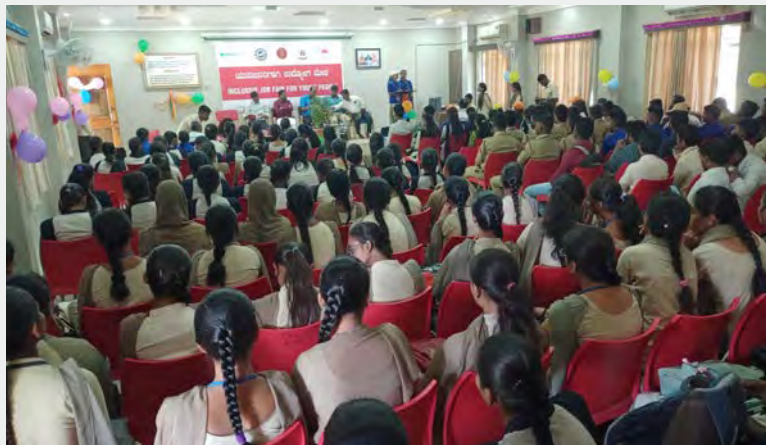
Job Fair at Koppal