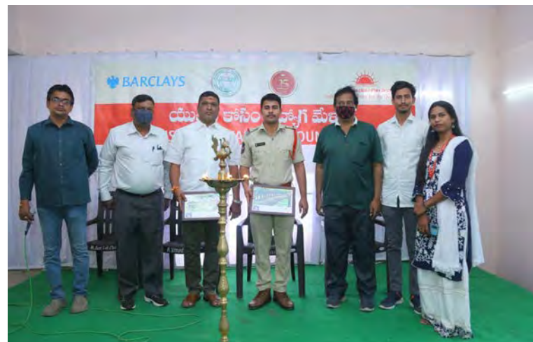
Job drive inauguration, Hyderabad