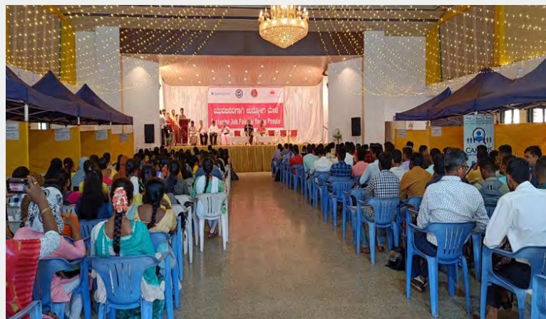
Placement drive at Belagavi