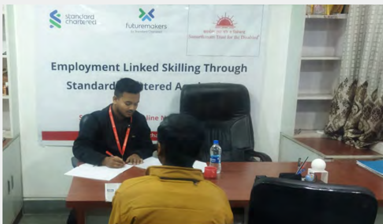
Interviews at Bhopal