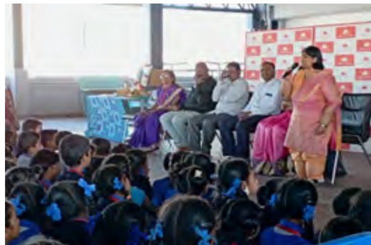
Youth Day celebrations