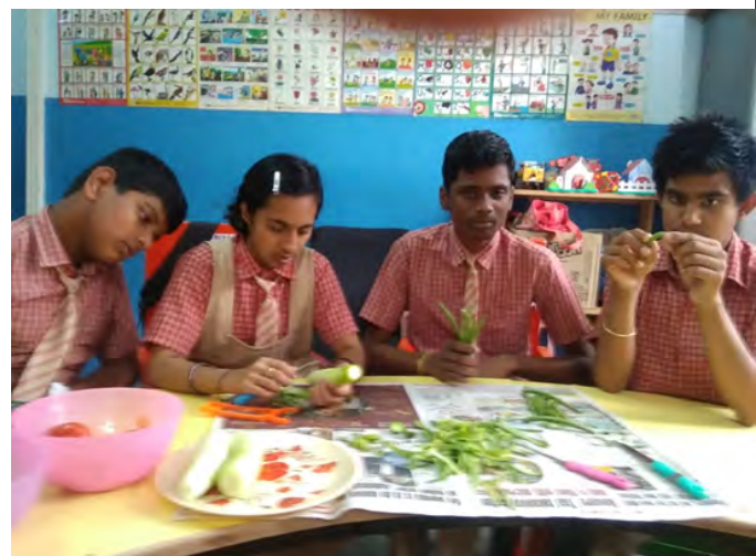
Fine motor skill activities