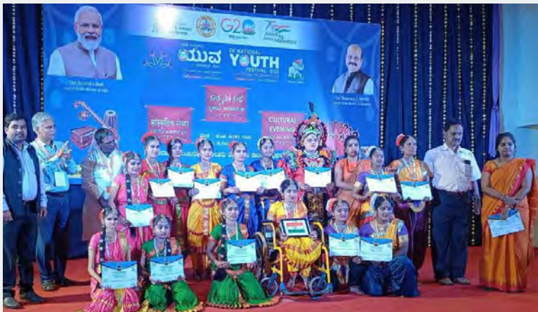
Youth Festival, Dharwad