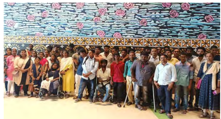
Industrial visit for Chennai beneficiaries