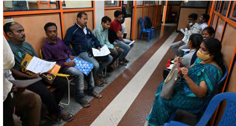
Job drive at Bangalore