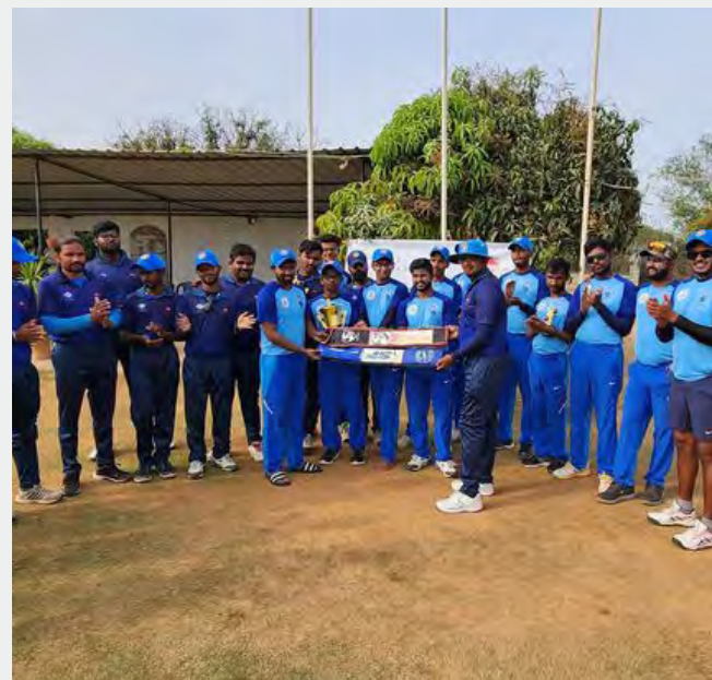
Blind cricket match with Purple Quarter volunteers

Allstate, Althea, ANZ, BNPP, Bread financial, Cisco, Dell, DXC, Fiserve, GKN Aerospace, Kotak Life, NatWest, Nike, Purple Quarter, Qualcomm, Saviynt, and SEG automotive.