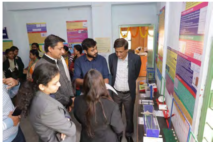
Mini Science Centre in Santoshpur Rishi Aurobindo Balika Vidyapith