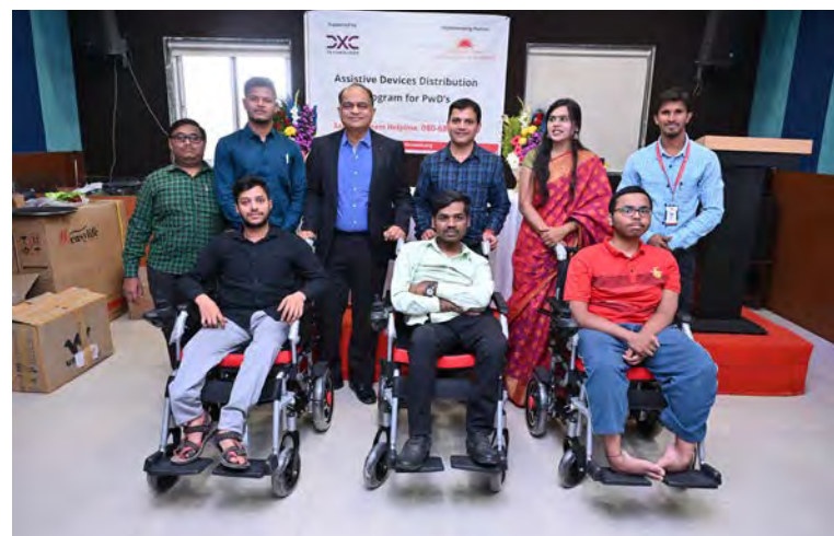
Assistive aid distribution, Pune