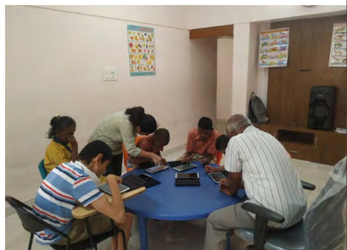
AVAZ App training for Belagavi ID school staff