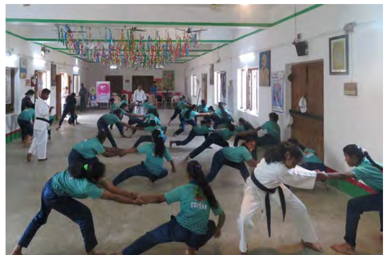
Self defense training by APF

Stepping into the second year of implementation of the project 'Empowering and transforming blind women through cricket' supported by Azim Premji Foundation, the project has completed a total of 6 coaching camps, 6 Self Defense training and 6 one-day sessions on entitlement awareness for the visually impaired. A total of 180 blind women players received cricket coaching during the quarter. 14 skilled players from Madhya Pradesh, 7 from Jharkhand and 8 from Odisha represented their states in the IndusInd bank women's Nationals, T20 Cricket Tournament for the Blind 2023, held in Bangalore with the support of the APF project.