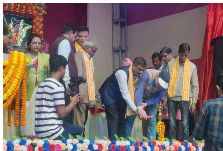
Mini Science Centre in Chanda High School