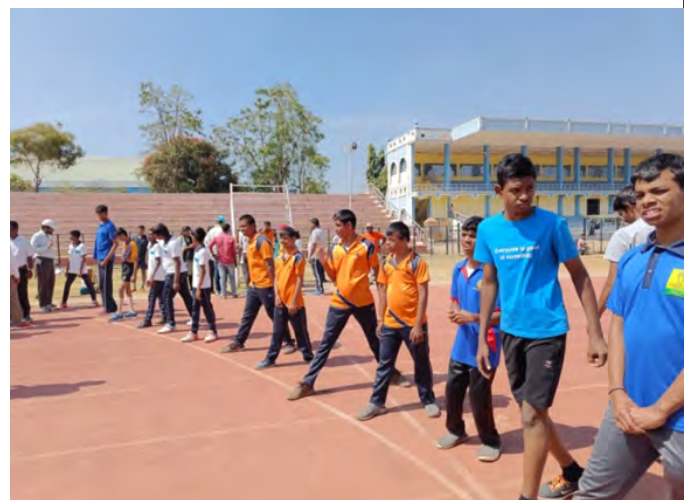
State Level Para Athletic Championship