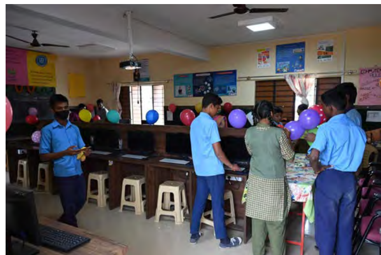
Tinker Lab in Sarakki