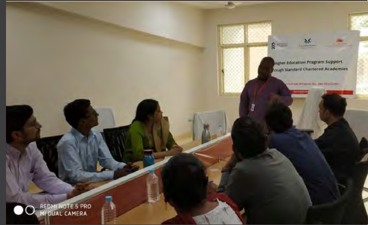
Training on screen reading software