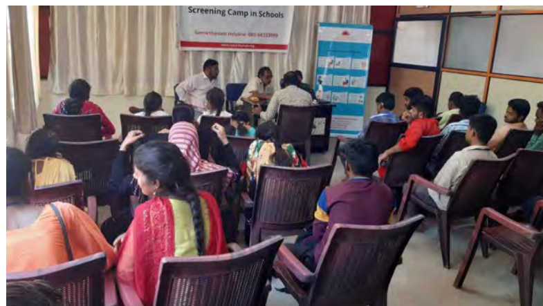
Hearing screening camp, Kodikonda