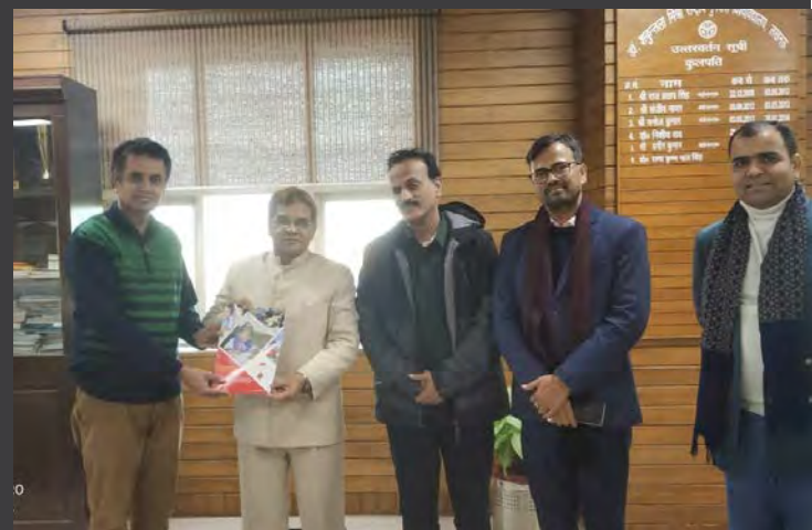
MOU with SMU, Lucknow