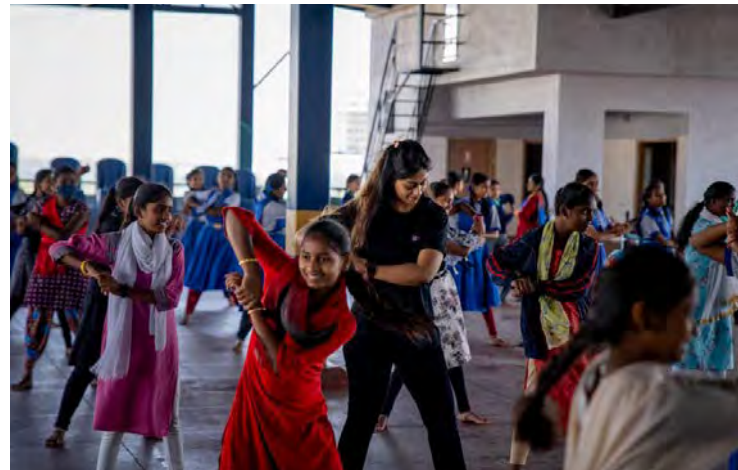
Self-defense workshop by Byju's