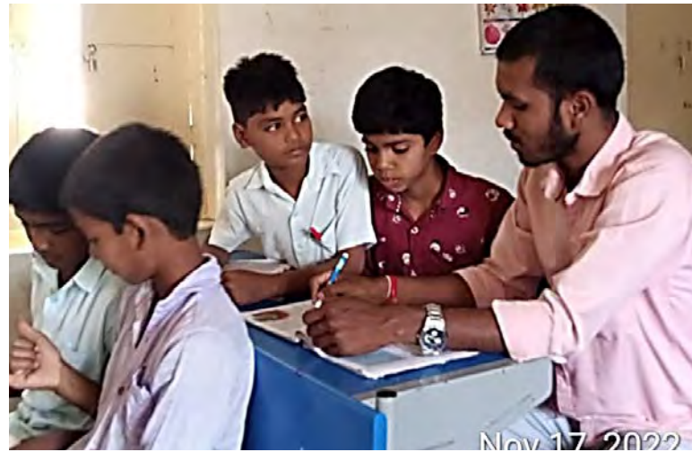
Education activities under IEP

United Way Bengaluru in partnership with Samarthanam Trust, inaugurated a Tinker Lab at Morarji Desai Residential School, Ramanagara, Karnataka and another at Karnataka Public School, Sarakki. Thanks to United Way Bengaluru, the facilities are going to present a space for the school students to learn and innovate using Technology and develop problem-solving skills.