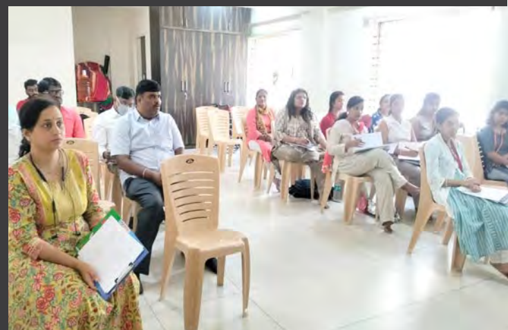
Workshop for HEP Coordinators