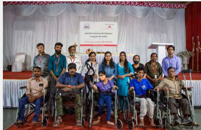
Assistive aid distribution