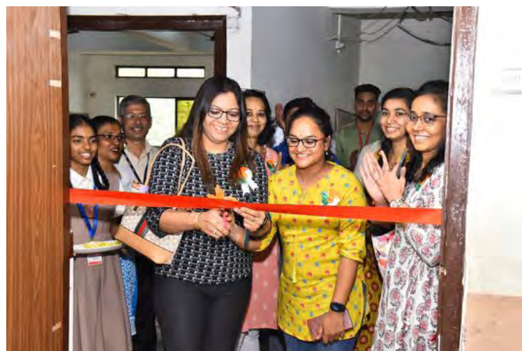
Smart Class in Mumbai