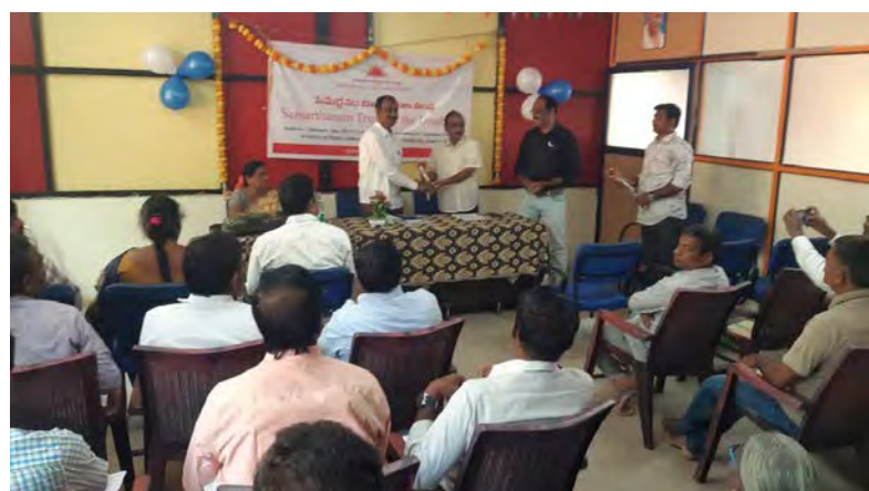
DRDA programme at Kodikonda