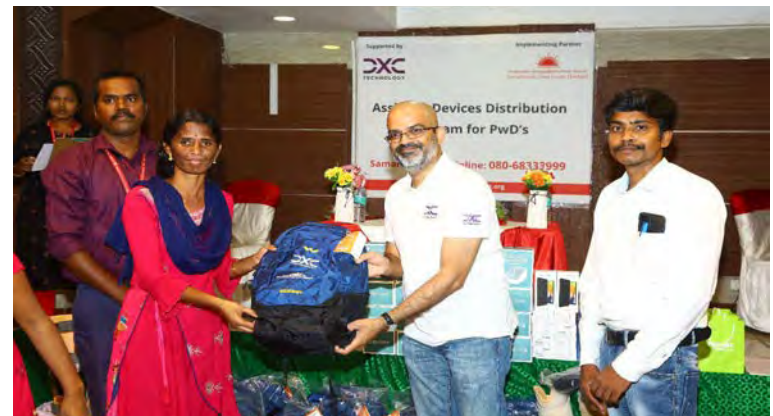
Assistive device distribution, Chennai