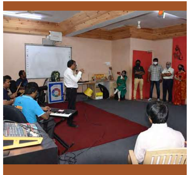
Music show at Samarthanam HQ