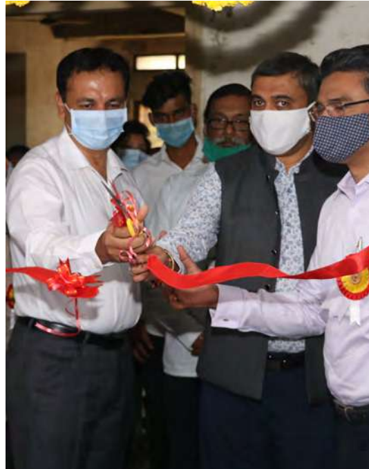
Mini Science Centre for STEM Learning inaugurated in Govt School at Mumbai by Otis India