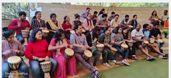
Discovery Village Resort