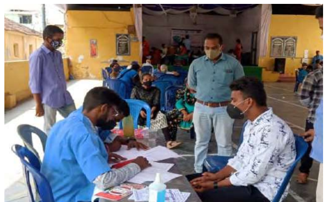
EyeMitra Eye Camp