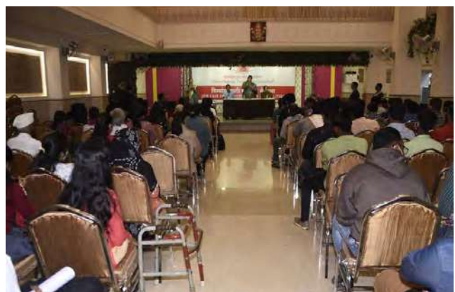
Job Fair at Pune