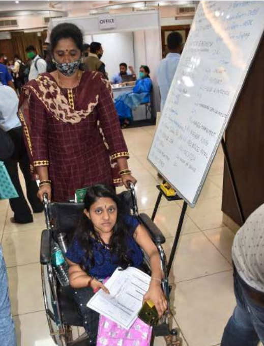
A mega Job Fair for Persons with Disabilities across eight major cities