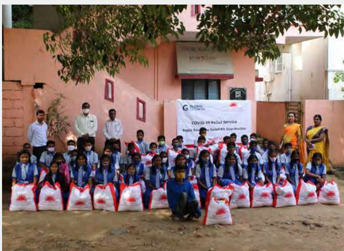
Kit Distribution by Global Growth