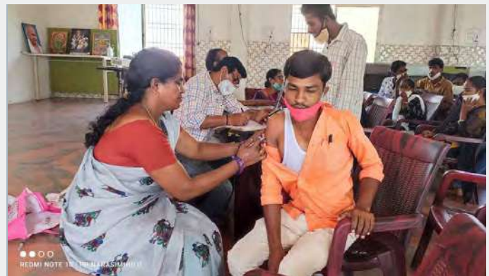
Vaccination campaign at Ananthapur