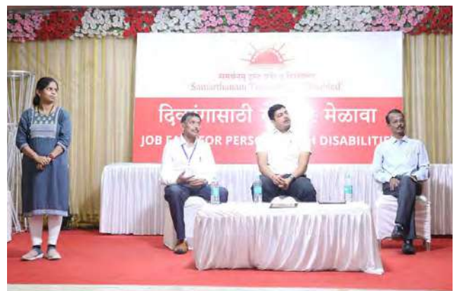
Job Fair at Mumbai