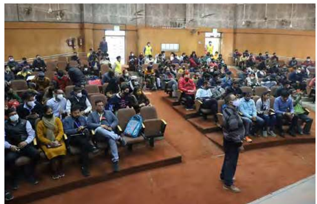
Job Fair at Delhi