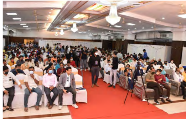
Job Fair at Bangalore

Samarthanam Pune organized a Mega Job Fair for Persons with Disabilities, and many received opportunities from recruiting employers.