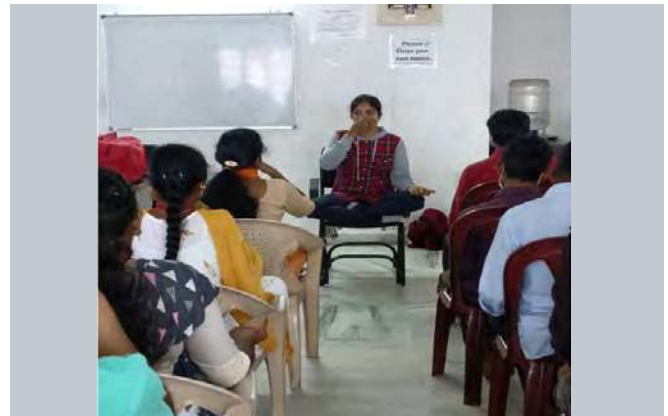
Yoga session by Lions Club