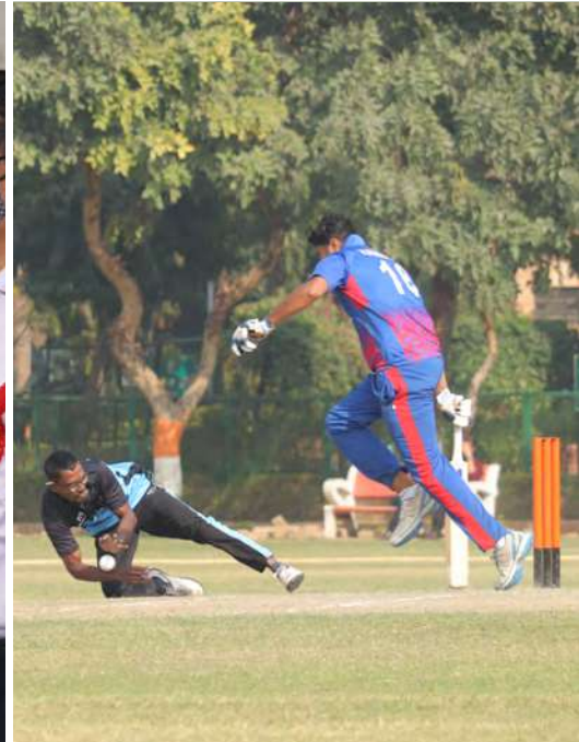
The Nagesh Trophy and Bilateral Series add momentum to the Blind Cricket season