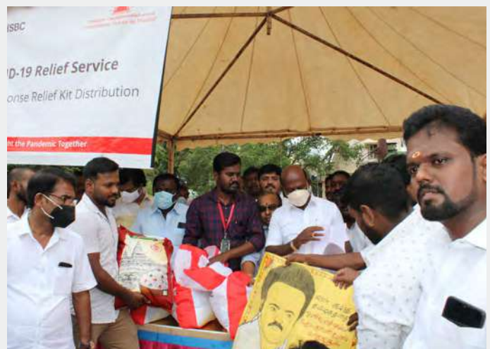
Kit Distribution at Chennai