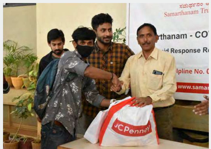
Kit Distribution by J C Penney