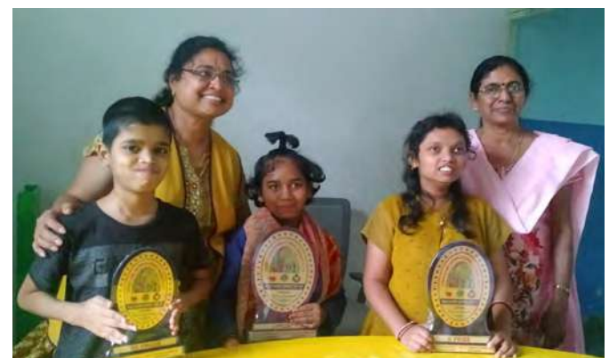
Lions Peace Poster Contest