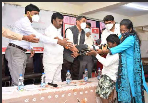
Assistive devices distribution