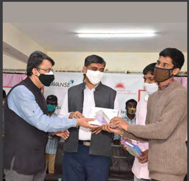
Avanse distributing Tabs to students