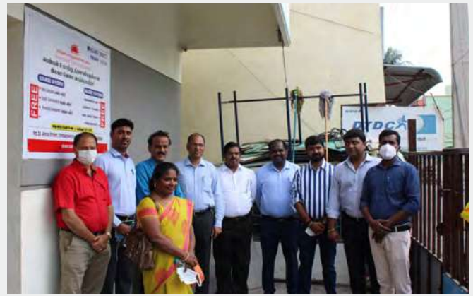
Redington Team visit