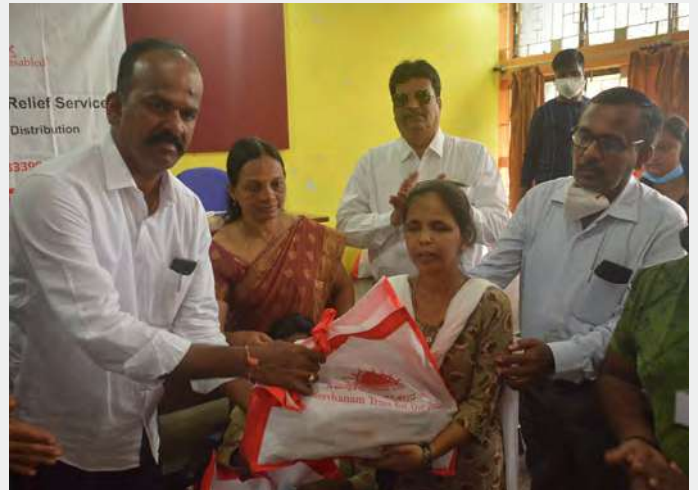
Kit Distribution at Davanagere