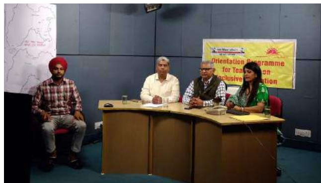
A one day sensitization programme organized by Sarva Shiksha Abhiyaan, Punjab, to train the Govt School teachers on inclusive education