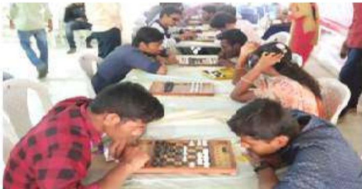
Chess, Braille and Quiz competitions at 'International Day of Persons with Disabilities Week' celebrations