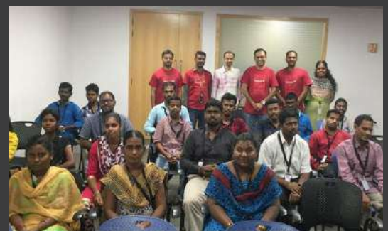
BACI volunteer visit