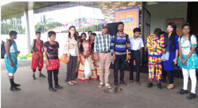
Dance Performance at Atkins