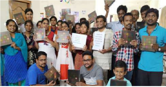
Salesforce volunteering activity