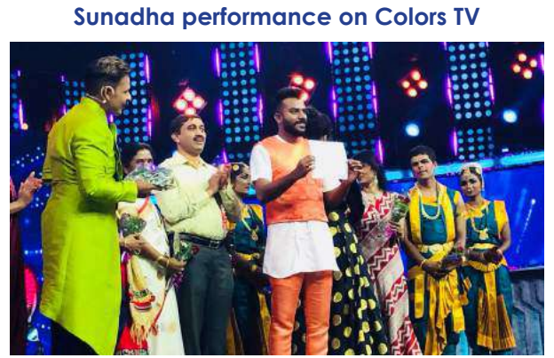
Sunadha performance on Colors TV