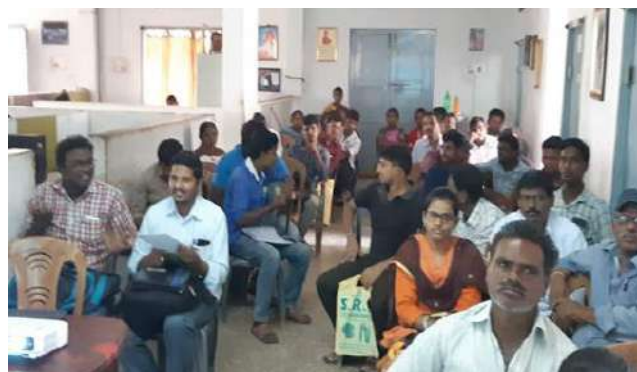
Job fair by Department of District Employment Exchange and Vindhya Info E media