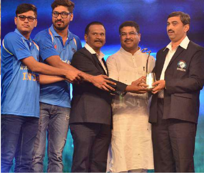
CNBC TV18 India Business Leader Award 2018