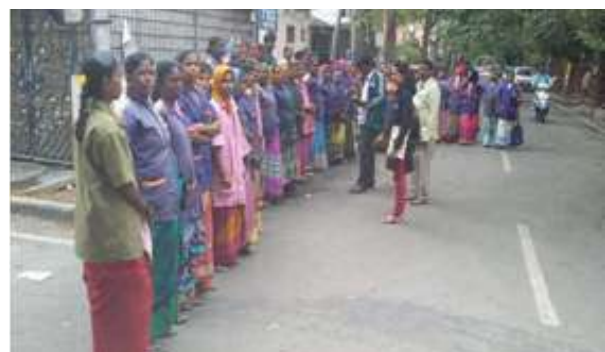
Muster point assembly