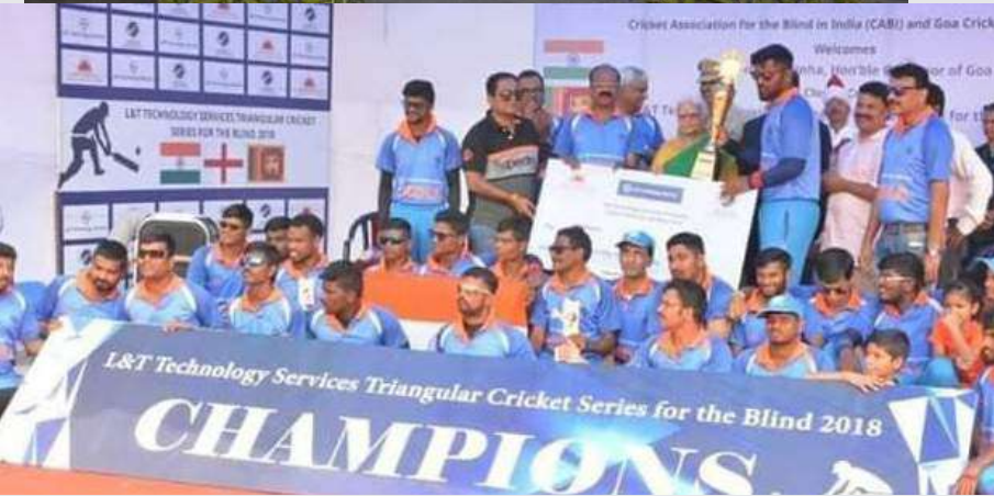
Indian Blind Cricket team lift the Triangular Cricket Series for the Blind 2018 winning trophy