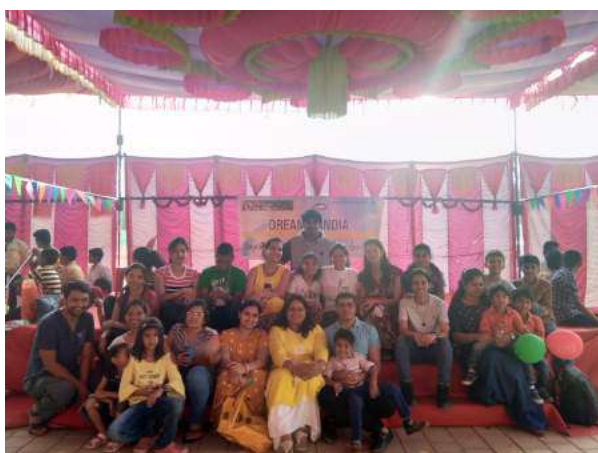
Drawing Competition by Dream India