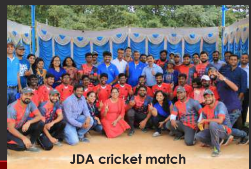
JDA cricket match