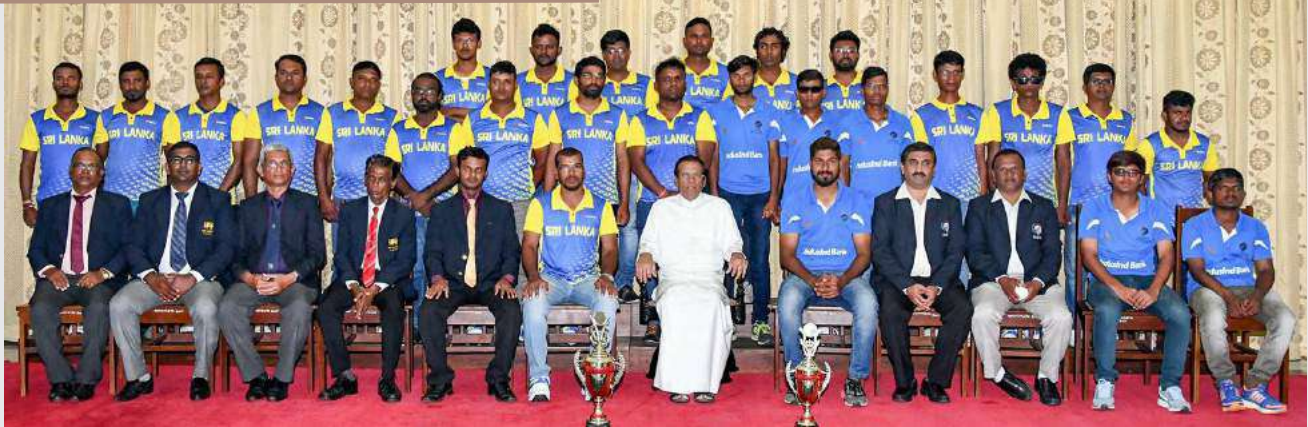
CABI and Indian Blind Cricket team with Honorable President of Sri Lanka, Maithripala Sirisena