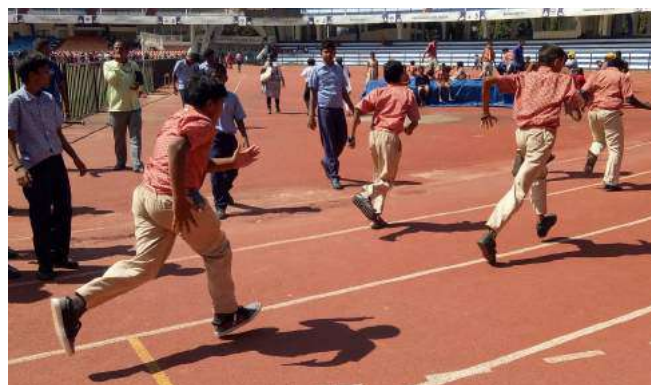
Sports meet by the Department of Empowerment of Differently Aabled and Senior citizens Bangalore Urban District at Kanteerava Stadium.