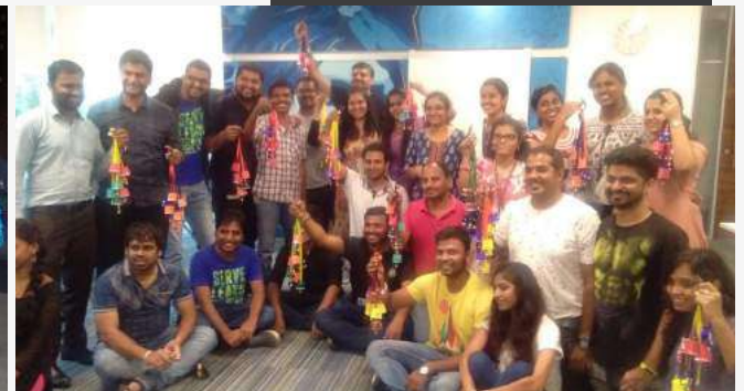
VMware service learning activity