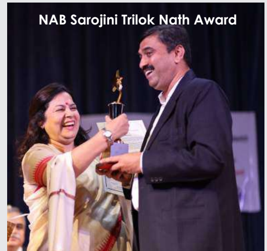
NAB Sarojini Trilok Nath Award