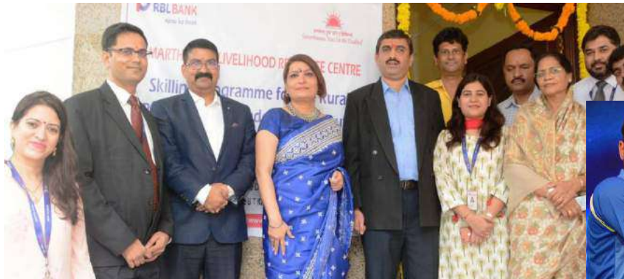
Launch of Samarthanam's Skilling Centre in Pune