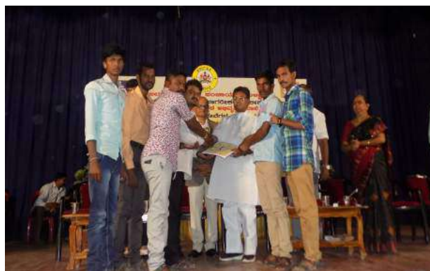
World Disabled Day programme by Ballari Administrative Department and Zillah Panchayat