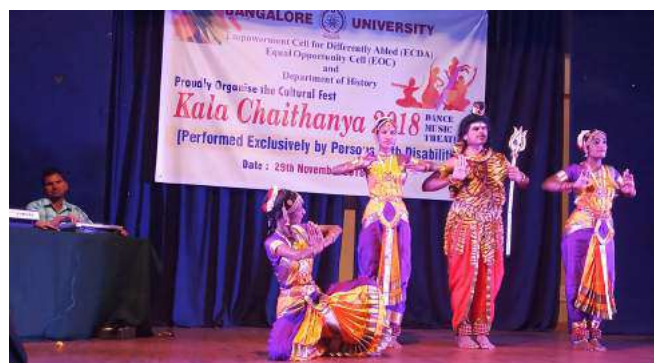
Cultural Festival "Kala Chaitanya 2018" by Bangalore University