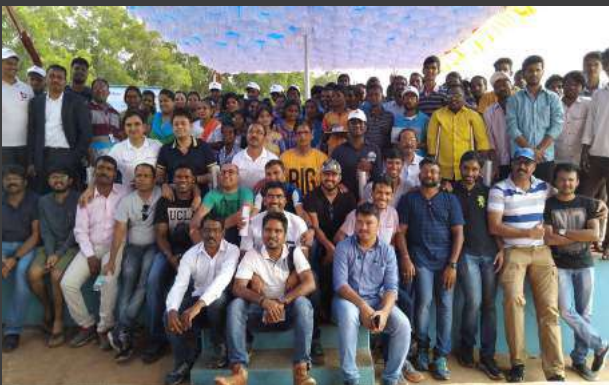
Friendly cricket match with RBL