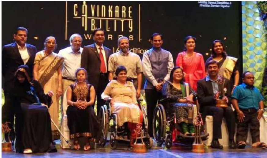
Cavinkare Ability Award for Eminence 2018