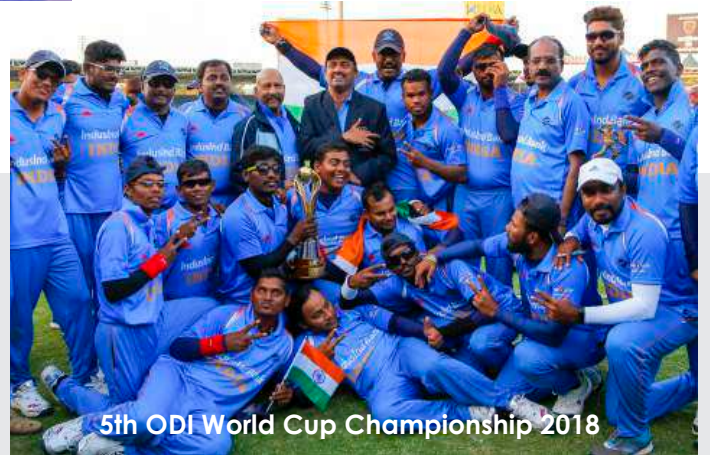
5th ODI World Cup Championship 2018