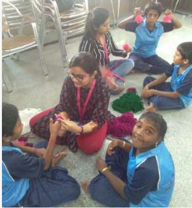
JD Institute of Fashion Technology