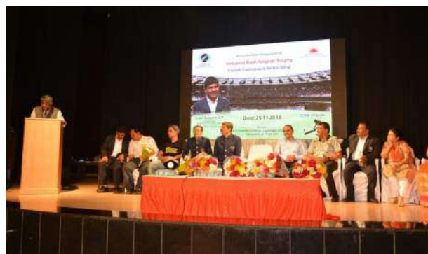
Nagesh Trophy launch