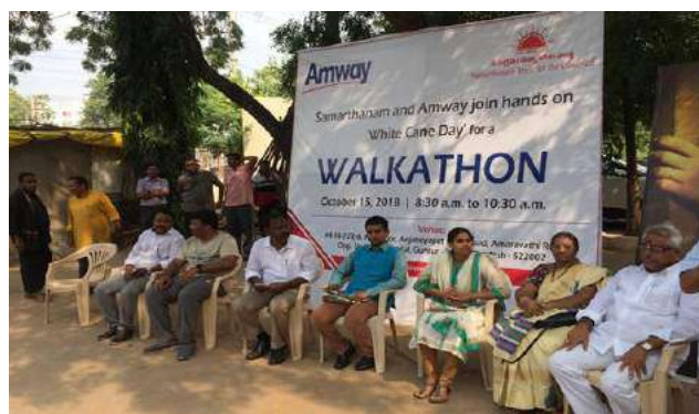
Walkathon commemorating the World White Cane Day with Amway