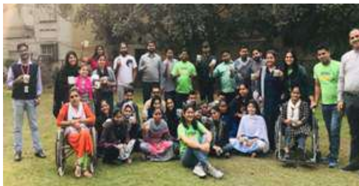
An interactive counseling session by Accord Hotels on the different job opportunities in the hotel industry