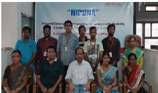
District Employment Exchange team visit