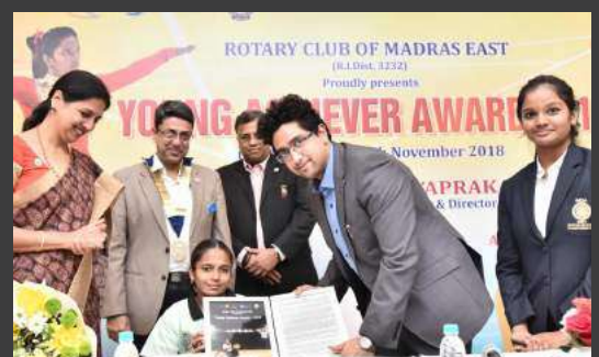
Young Achiever Award