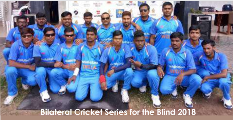
Bilateral Cricket Series for the Blind 2018