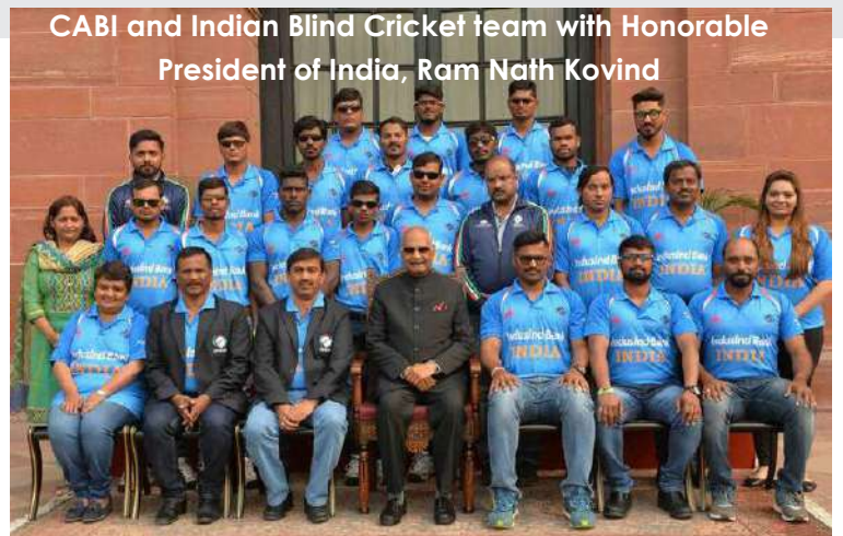
CABI and Indian Blind Cricket team with Honorable President of India, Ram Nath Kovind