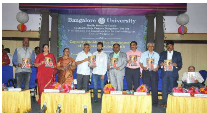
Workshop on Capacity Building for empowerment of differently abled youth at Bangalore University