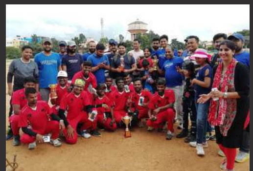
Match with Morgan Stanley