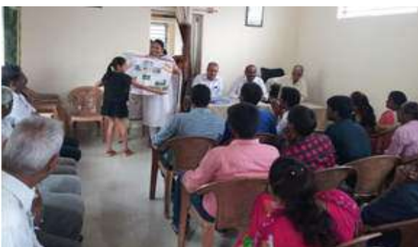
Swachhata Abhiyan Yojana Adyalaya

Alongside, WOW Team has conducted Swachhata Abhiyan Yojana Adyalaya program at a ward in Madiwala along with Pura Karmikas (PKs), BBMP Officials to educate the general public on recycling. The team also visited muster points and discussed the area challenges with respective BBMP Officials and PKs.