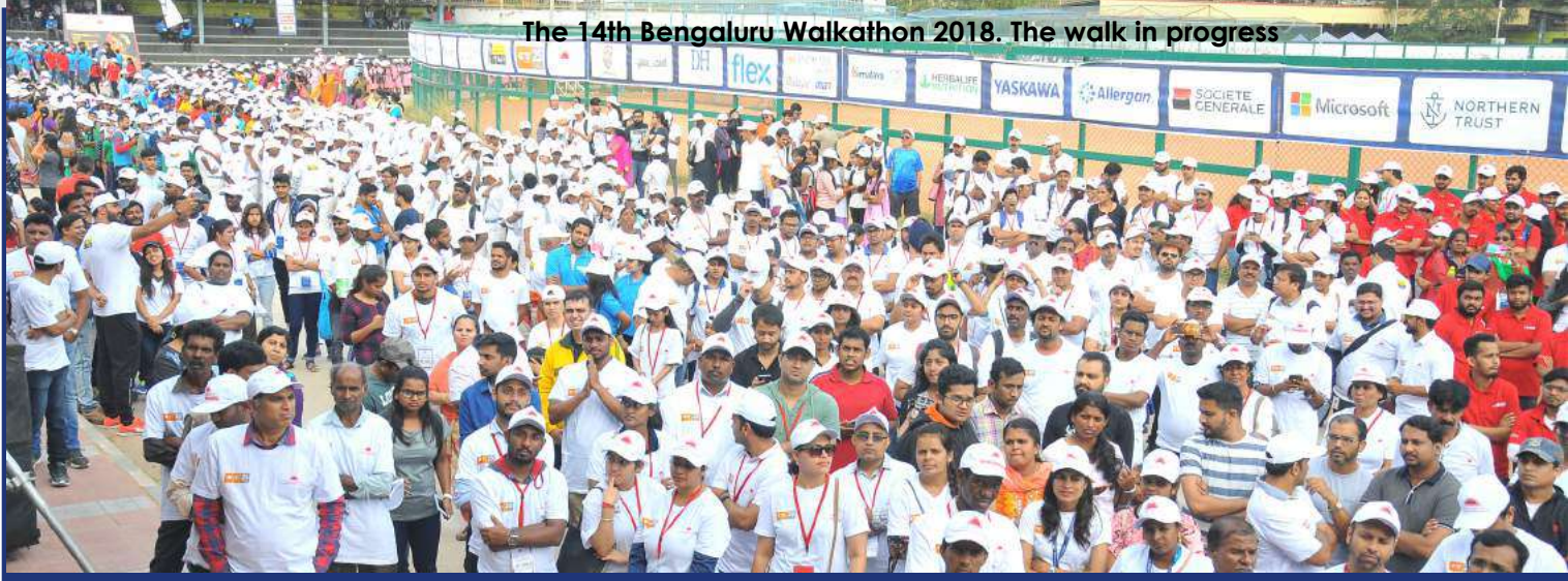
The 14th Bengaluru Walkathon 2018. The walk in progress