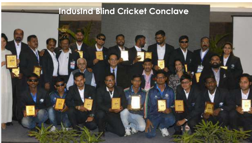
Industnd Blind Cricket Conclave