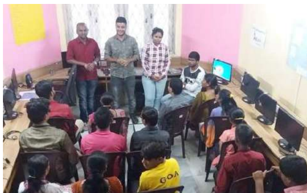
Guest session on cold calling by an expert customer service executive from Chandigarh