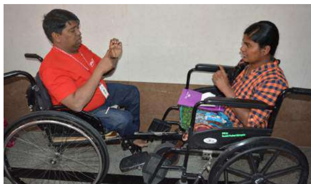
Sign Language Training