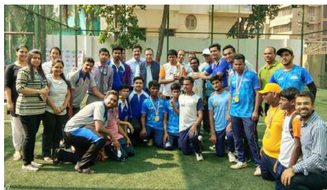
Blind Cricket Match with volunteers from Transworld Logistics