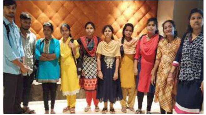
PVR Cinemas campus recruitment drive