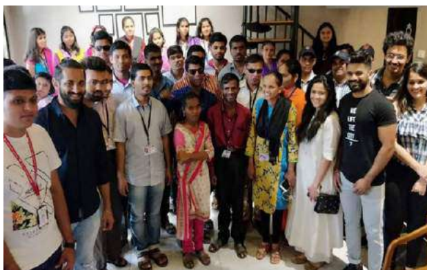
Italian food tasting event at the new Pesto Bistro cafe by Samarthanam students