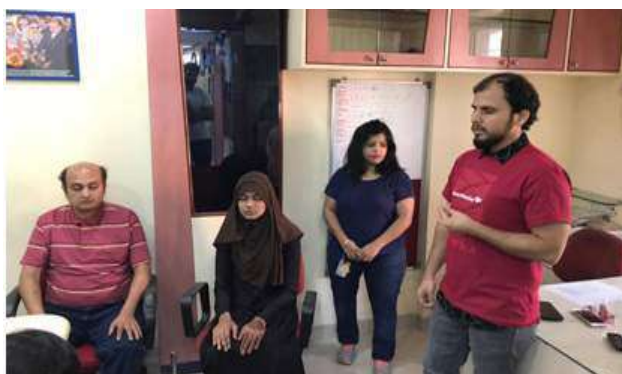
Session on Interview techniques by Bank of America volunteers