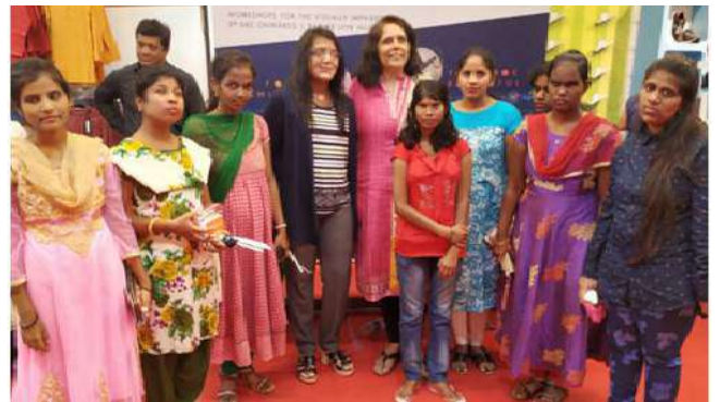
Cooking and Fashion tips session by National Association for the Blind India and Big Bazaar