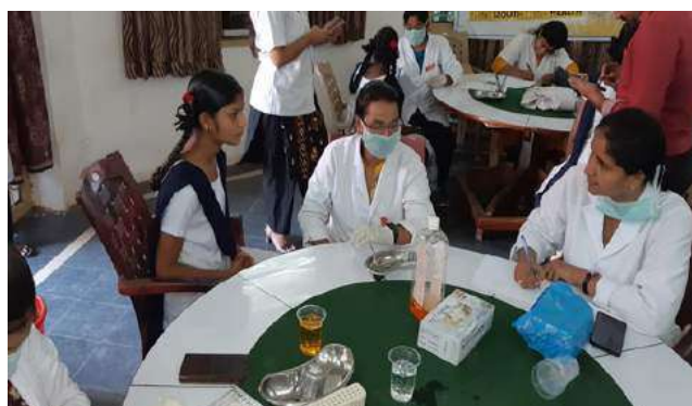
Free dental camp by Sibar Institute of Dental Sciences and North Club Guntur