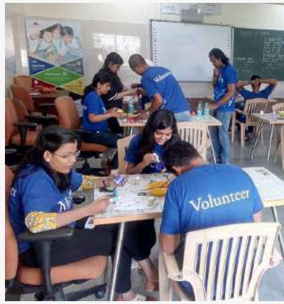
Handmade decor & crafts workshop

Quiz, dance, fun games, educational activities, arts, crafts and goodies distribution by