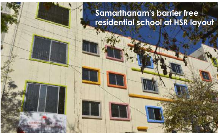
Samarthanam's barrier free residential school at HSR layout