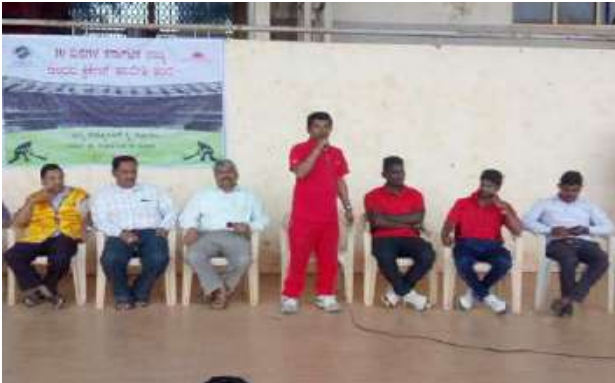
A ten day Coaching Camp for Karnataka Blind Cricket Team