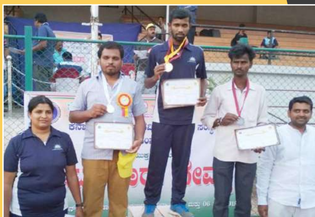
Dharwad State Level Athletics Meet