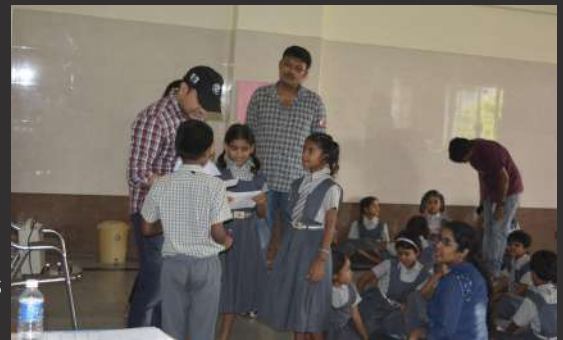
ANZ Summer Camp

A ten-day summer camp was sponsored by ANZ comprising of various theme based, art and fun activities and sessions which were informational, educational and entertaining. The topics covered during the camp were the environment, history, habitation, the lifecycle of an organism etc by 76 volunteers from ANZ. Apart from ANZ there were other corporate companies that took part in the summer camp which include, Hinduja Global Solutions and Brillio.