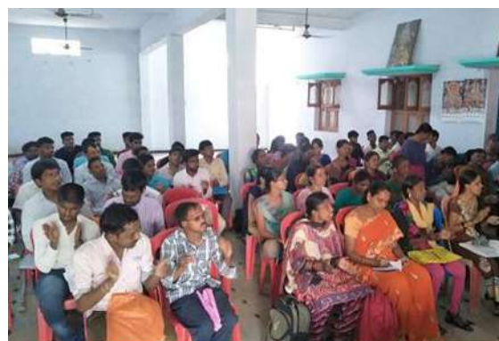
APSSDC Job mela

Samarthanam Anantapur initiated a job mela headed by the Regional Head of Microsoft Program. The fair was organized for youth with disabilities in association with Andhra Pradesh State Skills Development Corporation (APSSDC). HR managers of various companies came forward looking for impressive talent trained at Samarthanam Anantapur and made some immediate hiring.