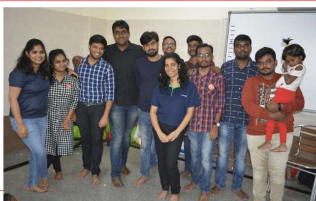
Simeio Solutions volunteers