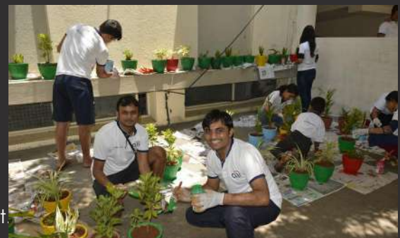
CitiFoundation Global Community Day

CitiFoundation celebrated the Global Community Day with Samarthanam. This year the event was inclined to World Environment Day and volunteers painted the pots, planted the saplings and created products out of waste material mainly plastic. It was a huge event where more than 120 volunteers from CitiFoundation participated.