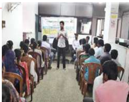
Vidya Helpline session