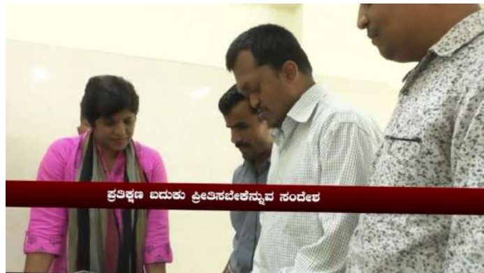
Focus TV coverage

A special story was covered on Sunadha by Focus TV defining the challenges and achievements of the artists with disabilities.