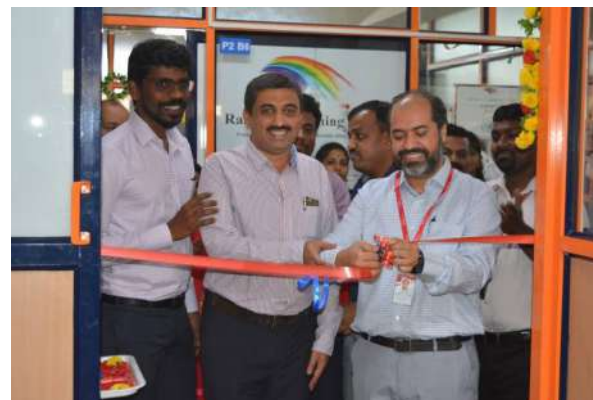
Smart+ Centre inauguration

Samarthanam is creating a suitable platform for the youth with disabilities with immense exposure and different career opportunities, as part of which the trainees visited a Corporate for soft skills sessions and an exposure visit introducing them to the formal work culture.