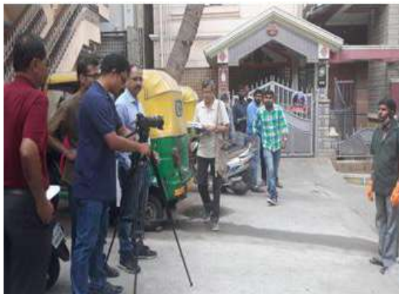
A Documentary on WOW

Alongside, a movie has been pictured on WOW by ITC Management and Shape Team who visited the field and recorded the activities of WOW. Earth Day has been celebrated by RWA's of Jakkasandra Ward and WOW team who briefed on the project to public. On the other hand ITC Management and Mumbai Municipal Corporation team had visited the field to monitor and to observe the quality of work. World Environment Day has marked its importance with the theme 'Beat Plastic Pollution.'