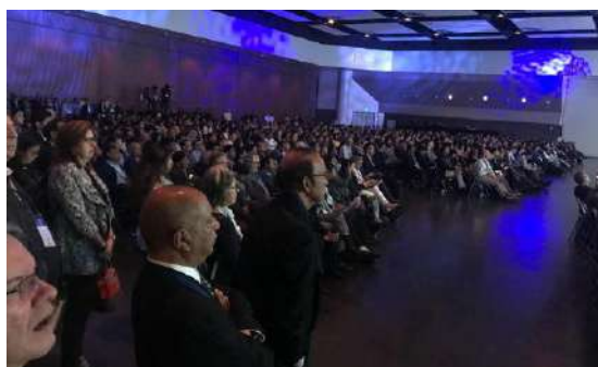
TIE Inflect 2018 at California