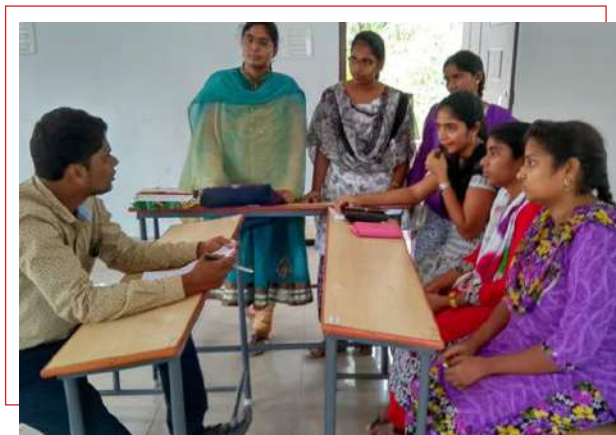
APSDC Job mela