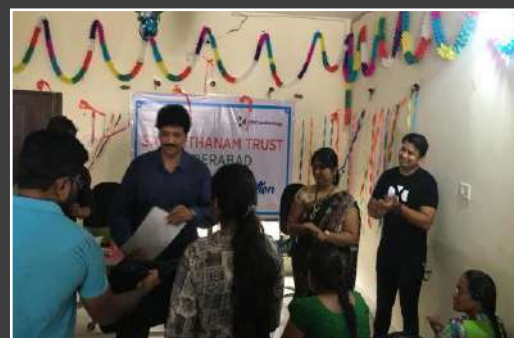
DXC Technologies at the inauguration ceremony

Apart from the regular training sessions, beneficiaries receive guidance on healthcare, hygiene, fitness by expert volunteers. Teams from Amazon, Well Fargo, Salesforce and Google visited & interacted with the beneficiaries. A few also trained them in areas like personality development, resume building and introduced corporate work culture. Anagha technologies recruited from the centre and DXC technologies graced the inauguration ceremony. A friendly cricket match was played with the team from Salesforce.