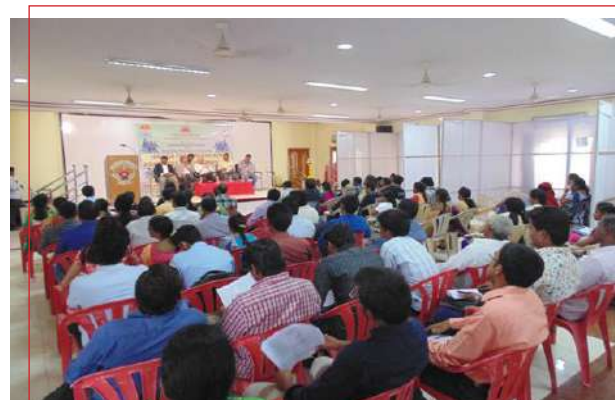
APITA Job fair

Samarthanam in cooperation with APITA (Andhra Pradesh Information Technology Academy) & Hindu College of Pharmacy & Shaksham (NGO) & Vavilal trust (NGO) organized a Mega job mela at Hindu College Of Pharmacy. Around 1000 students registered for the job fair where many reputed companies participated.