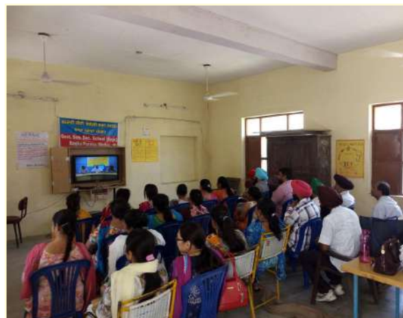
Training via EDUSAT

* The author is an expert on inclusive education and currently is the National Program Manager- Education at Samarthanam.