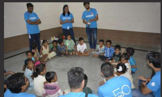
Intel volunteering activity

Intel conducted a huge volunteering activity with our primary school where 100 volunteers took part in the event. They sponsored and served meals to the kids. They also distributed 210 School Bags, 700 Notebooks for the ID and High School.