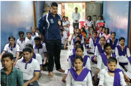
International Yoga day