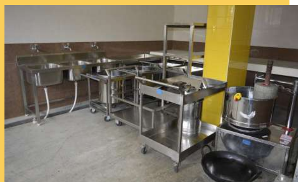
Samarthanam mechanized kitchen