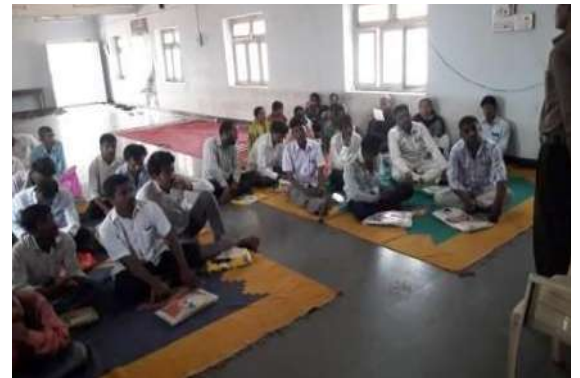
Career counseling camp

Gadag centre initiated a new batch with the support of ANZ. A Career Counseling Camp was held at the Taluk Panchayat meeting hall which provided quality guidance and counseling for PwDs creating awareness on Samarthanam's services. On the World Environment Day, a programme was organized where the visually impaired students interacted with the chief guest and guests with a small demonstration on JAWS. Many students, staff, volunteers, Scouts, and Guides' team from the surrounding schools and colleges also participated in the World Environment rally.