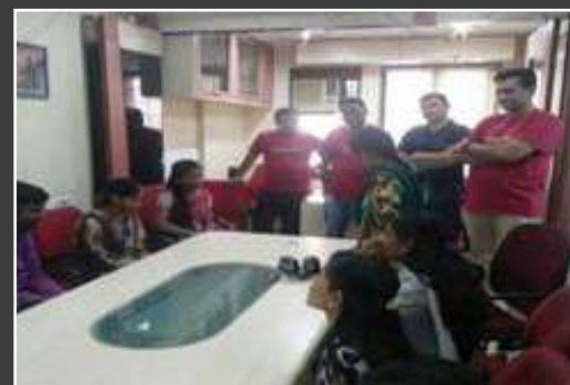
Bank of America session

Mumbai Digital Film Academy came forward to record the activities of LRC and make a documentary on the same. Apart from offering a state-of-the-art training module to the beneficiaries, the staff from the centre attended various workshops and seminars. The Centre Head attended a round table discussion organized by I-Probono on legal assistance to Civil Society organizations, and staff attended a seminar on 'Capacity Building for Non-profit Organizations' and 'CSR Journey' organized by the Indian Merchants Chambers.