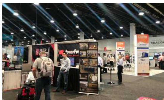
Waste-Expo at Las Vegas