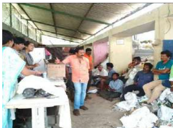
Programme Officer meets PKs

"Well-being Out of Waste (WOW)" is a recycling programme executed in associated with Paperboards and Specialty Papers Business of ITC. It focuses on ensuring proper segregation, recycling of waste and create awareness on "Reduce-Reuse-Recycle". This quarter, officials from ITC along with the Program Coordinator made separate visits to the various warehouses to interact with the team and offer suggestions for improving the quality and the quantity of the material. In a meeting with PKs, the Programme Officer, WOW appreciated their continuous efforts to make the city clean and green. He also discussed the issues faced in the field and advised to encourage household waste segregation. This quarter a total of 23,27,378 kgs of dry waste has been collected.