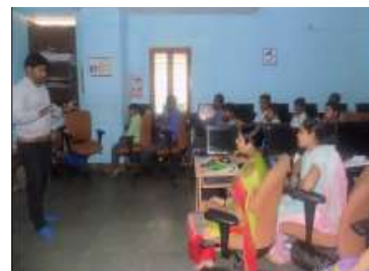
On job training