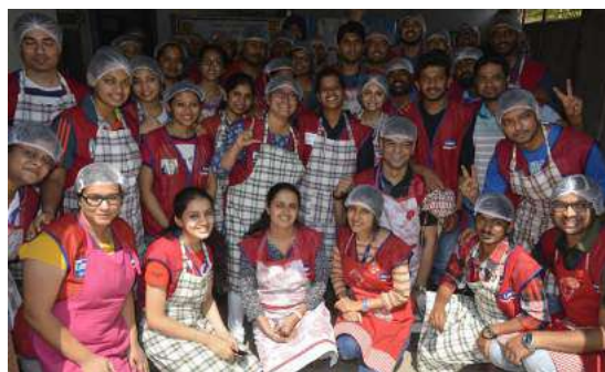
Lowe's India volunteers cooking activity