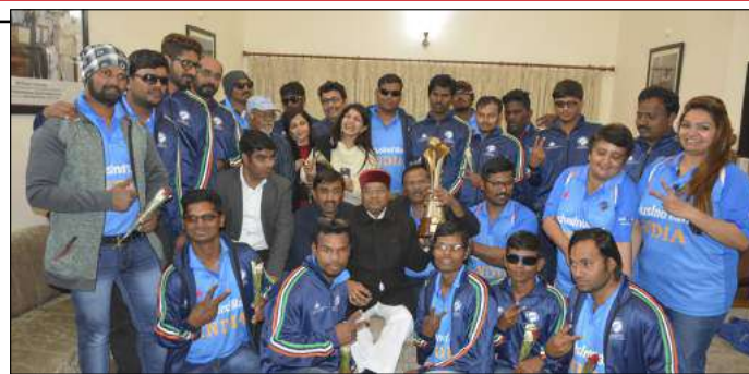
Minister of Social Justice and Empowerment Shri Thaawar Chand Gehlot