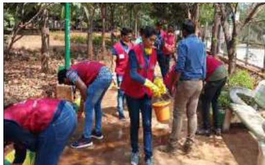
Lowe's India volunteers cleanliness drive

About 37 students from Christ University, NPS, BMS College, ISBR Business School, Symbiosis Law College-Pune, IFIM Law College, NMIMS-Bangalore, Oxford College of Arts and St John of God-Kottayam have completed their internship at Samarthanam this quarter. They were engaged in all the programs right from schools to LRC.