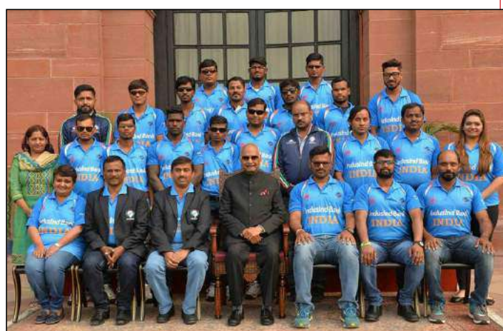
Hon President Shri Ram Nath Kovind