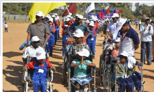
Samarthanam Sports Meet