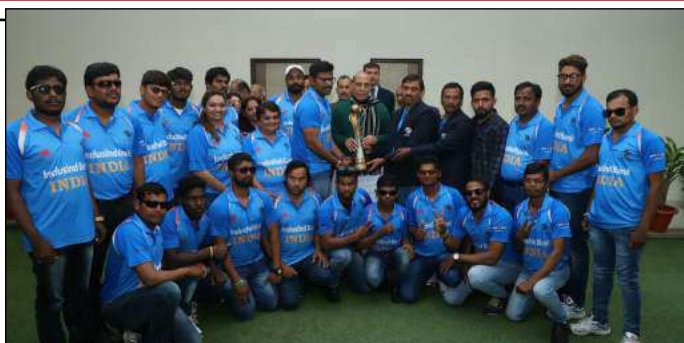
Home Minister Shri Rajnath Singh