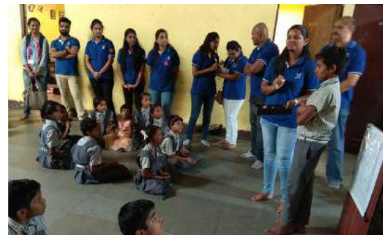
Micro Focus activity at Primary School