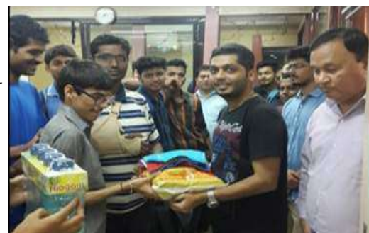
Fintellex voluntary activity