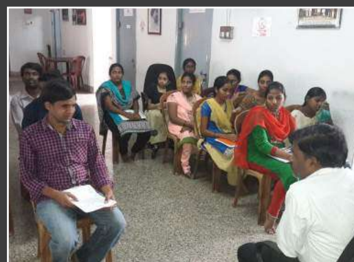
Apex Solutions visit