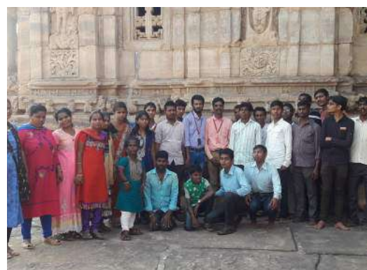
Trip to Badami