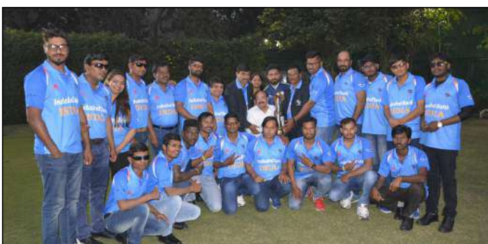
Hon Vice President Shri Venkaiah Naidu