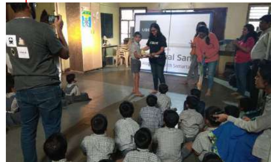
Uber visits Primary School