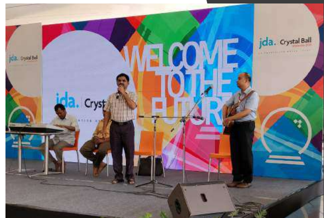
Crystal Ball Showcase