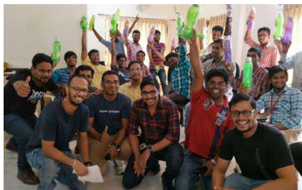
Activity by Salesforce