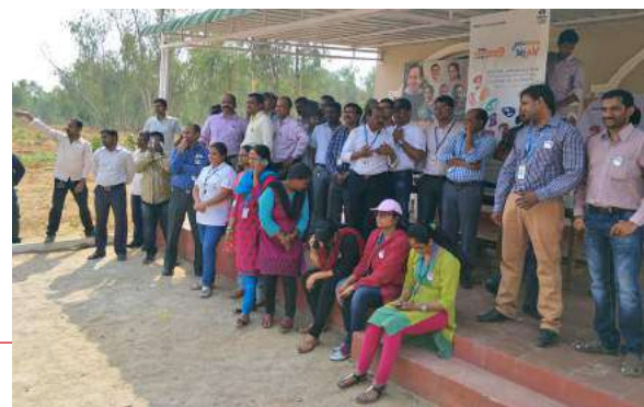
Tata Communications Activity