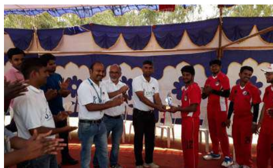
Tata Communications cricket match with Samarthanam's Blind Cricket team