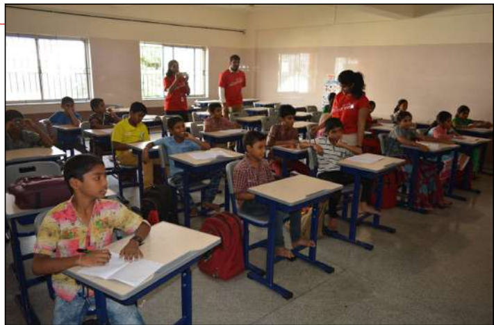
Wells Fargo volunteering activity