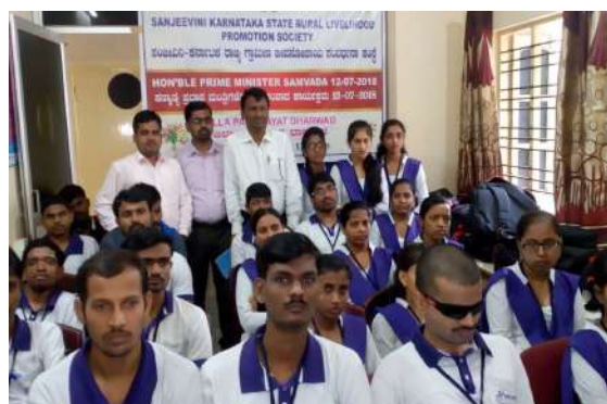
Prime Minister Video Conference

Kargil Vijay Diwas Celebrations were organized to pay tribute to our armed forces in presence of NNC Unit Dharwad to pay homage to the martyrs by lighting the candle. Two campus drives were held by Karvy and TATA human resources and a mobilization workshop at Navalagund taluk.