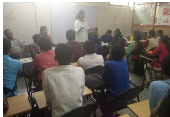
A session by Standard Chartered Bank

19 various prestigious organizations from 6 diverse employment sectors like IT, Retail, BPO, Hospitality, Manufacturing and Banking and Insurance participated in the job fair. Around 464 disabled youths participated in the event. Bangalore LRC witnessed volunteer sessions from Standard Chartered Bank, Central Silk Board industry, Microland, CITI, Textron, HGS, ANZ, Wells Fargo, Wipro, Sutherland and Eli Lilly.