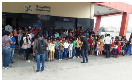
A metro ride with HPE volunteers

Hewlett Packard Enterprise (HPE), took 100 children of our primary school for a Metro ride followed by a visit to the Planetarium. Total of 60 volunteers participated in the activity and took care of the children. Towards the end, the volunteers took them to Cubbon Park and involved in active games making the day memorable.