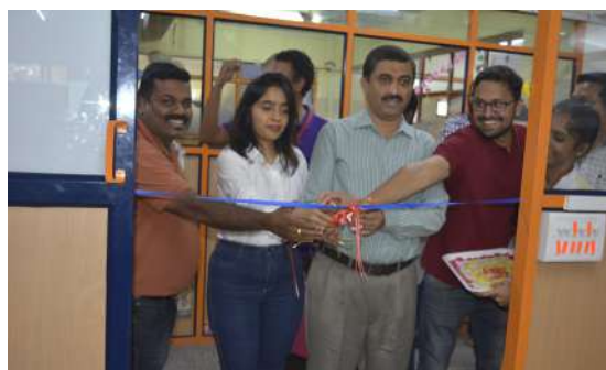
GKN Aerospace Library inauguration