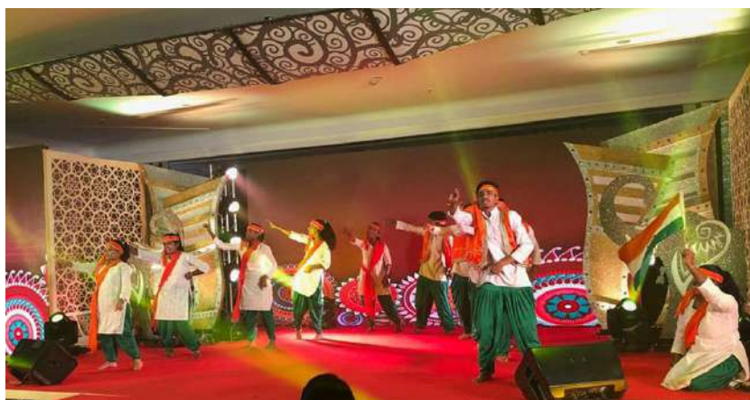
Sunadha performance at GKN Aerospace

The music and the dance teams including artists with visual and speech impairment gave performances at the Independence Day celebration organized by The Braille Resource Centre, Independence Day event by ABB Limited, Employee Recognition Day 2018 event organized by GKN Aerospace and Spirit of Wipro Run – 2018 by Wipro.