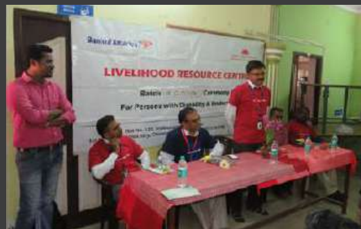
BOA supported 5th Batch Inauguration

The 2nd Batch of trainees, supported by Societe Generale, has completed their course and a closing ceremony was organized for the candidates along with Societe Generale CSR Head and Communication Head, who appreciated the students for the progress.