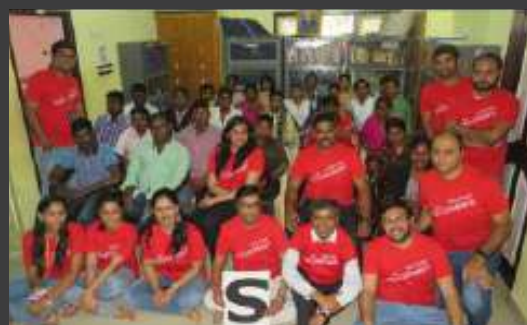
Wells Fargo visit