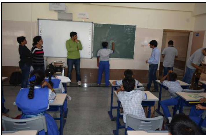
ANZ volunteering activity