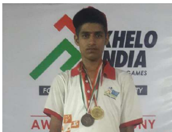
Khelo India Nationals winner