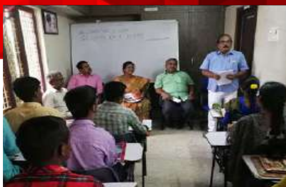
Coordinator of National Career Services at the session

An industrial visit was organized to M/S MGM Springs Pvt Ltd where the senior officers explained the process and manufacturing of variety of springs. They have narrated the procedure and the functioning of different machines to the trainees who actively participated.