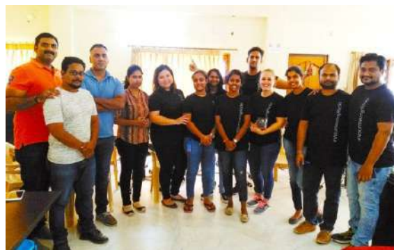
Salesforce Volunteering activity

Samarthanam Hyderabad centre beneficiaries, as part of volunteering, were part of mock interviews sessions, group discussions and personality development classes held by Amazon which was very helpful for building a professional career and for social interaction. Two more sessions were held, one by Salesforce on softskills and career planning enhancing career prospects of beneficiaries and another by Wells Fargo, on softskills, personality development and interview skills. Vizag Air force Academy took a session on overcoming challenges faced by differently abled women which was enthusiastically attended by the trainees. Alongside 11 beneficiaries got placed in Anagha Technologies.