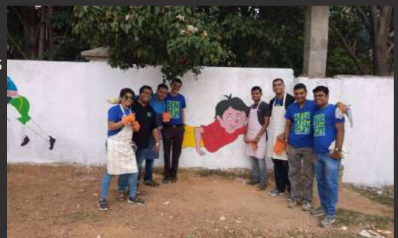
VM Ware wall painting activity

VMware painted the compound wall of Samarthanam in which 21 volunteers joined hands to create an appealing art work with a social message.