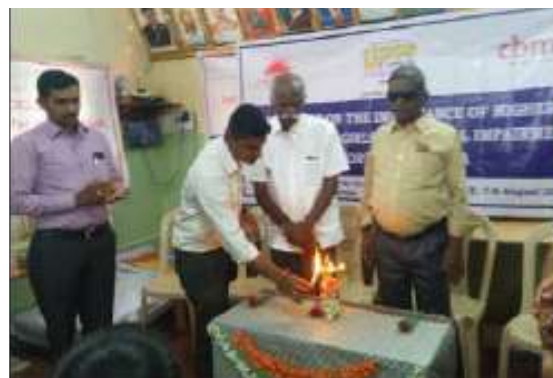
UDIS Forum workshop

At Samarthanam Gadag centre, two mock interview sessions were organized enabling candidates understand the various aspects of nailing an interview. Karnataka University Post graduate centre final year MBA and MSW students were invited as mock interviewers. Also a guest lecture session on health and food nutrition was conducted for the candidates by a health expert. UDIS Forum workshop was inaugurated by Samarthanam Gadag Regional Manager along with UDIS Forum representatives and other staff members of Samarthanam. More than 40 visually impaired students actively participated in the workshop.