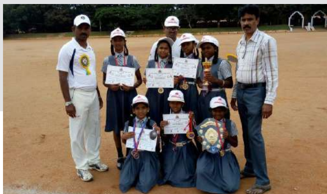
Cluster level Sports Meet

Many Primary and High school students also bagged prizes at Nakshatra, an annual inter- children's home sports and cultural talent fest organized by Bhumi (NGO) and Cluster level Prathibha Karanji, a cultural competition for students. At Taluk level, Athletics Sports meet organized by the Department of Education witnessed the participation of Primary and High School students who bagged many prizes.