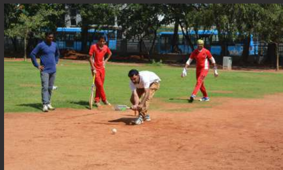
Societe Generale friendly cricket match

Societe Generale played a friendly Blind Cricket Match with our team at ITBP grounds. 16 volunteers took part in the game which was won by Samarthanam team. The winners received 3 bats for their team spirit and passion for the game from Societe Generale.