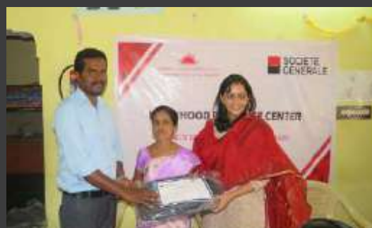
Societe Generale at closing ceremony