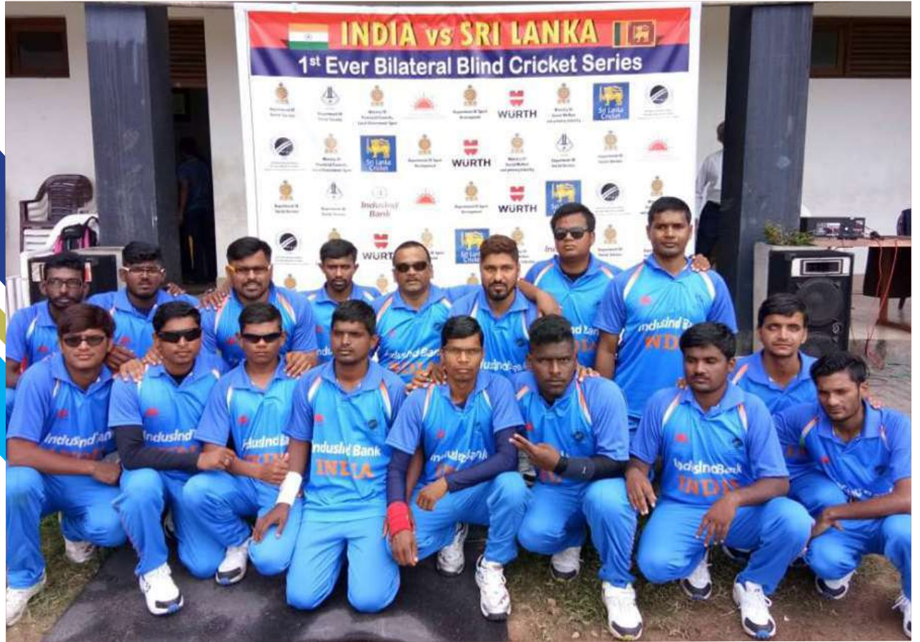
Sri Lanka's World Cup Winning Former Captain, Arjuna Ranatunga at the Presentation of the last T20 of the BlindCricket Bilateral Series