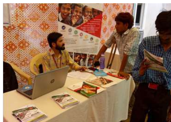
Disability camp by Red Cross Society

At Delhi Centre, a Disability Camp was organized in association with Indian Red Cross Society at Mahaveer Hospital, Faridabad. Also the trainees were part of a job fair organized by Dept. of Social Welfare, Haryana. A few prominent organizations were visited to meet the placement officers and discuss on the available placements. The team at Delhi conducted mobilization across various institutes, welfare organizations, and NGOs in and around Delhi, to raise awareness on the significance of the training programme offered by Samarthanam.