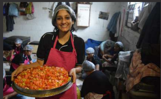
Epsilon Cooking activity

Epsilon prepared a nutritious meal for our children as one of the volunteering activity. 25 volunteers participated in the activity including some senior members who did everything right from cleaning and chopping the vegetables till the serving. They also shared the table with our children giving a feel of family warmth and environment.