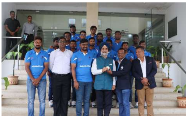
Indian Blind Cricket team with the High Commissioner, Taranjit Singh Sandhu

The objective of the First-ever Bilateral series India vs Sri Lanka, was to promote and develop Blind Cricket in Sri Lanka apart from motivating the Sri Lankan Cricket Board and Government to extend their support to Blind Cricket. It is the first tour of Indian team to Sri Lanka and with the intention of presenting an opportunity to the new generation of cricket players, 10 new players were included in the team. The tournament acted as a platform to encourage new talent in the field of blind cricket and help towards the betterment of the game.