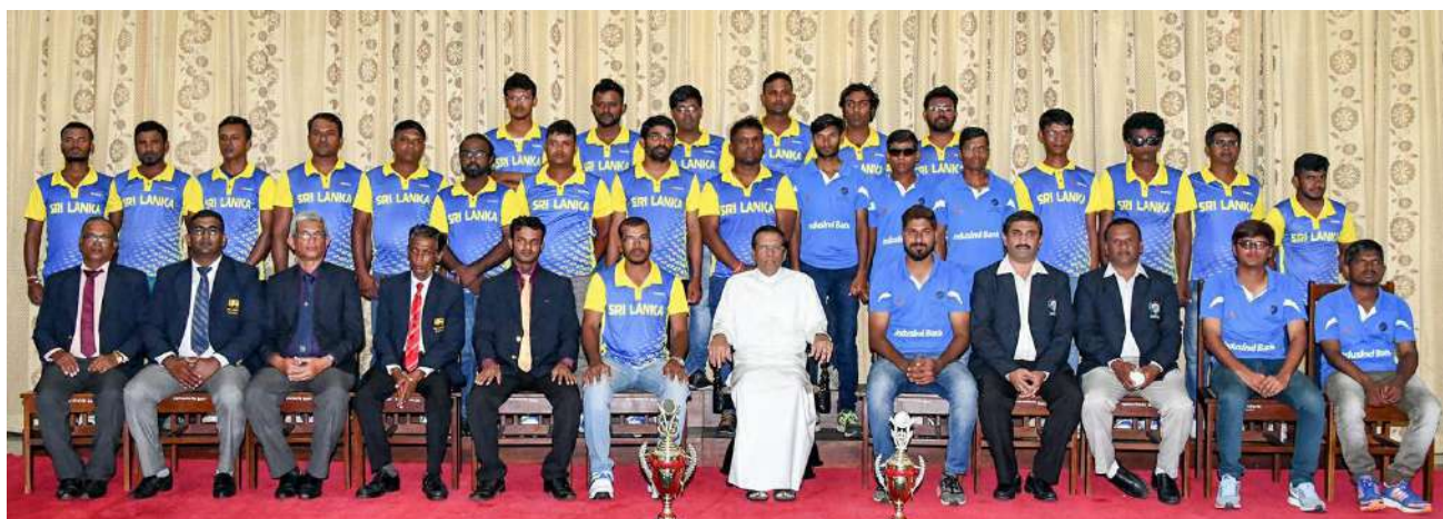
Indian Blind Cricket team and CABI team with Hon President of Sri Lanka, Maithripala Sirisena