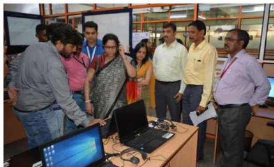
COO of Karnataka State Rural Livelihood Promotional Society visits

A total of 36 volunteers had visited the Library and demonstration was presented to 22 individuals and 15 companies. The total number of books uploaded in Sugama Pustakalaya is 558 and additionally Hindi language books also have been added.